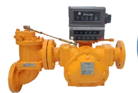
3" Mechanical Preset Package