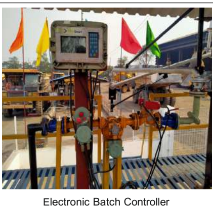
in Oil Terminal Loading Application