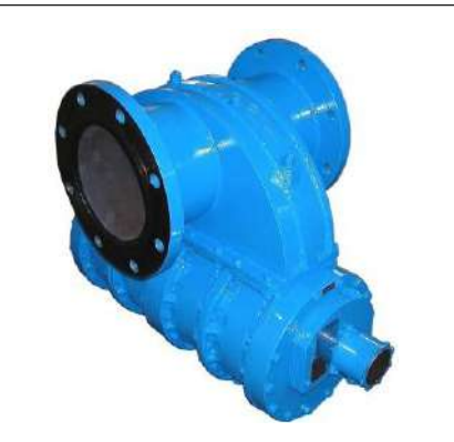
8" Meter with Pulse Output