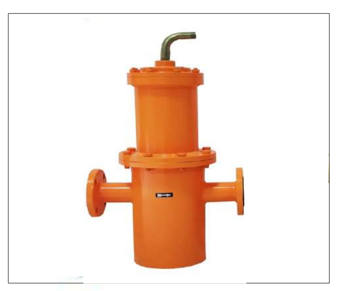
Bulk Air Eliminators (Air Separators)

The Vermont Bulk Air Eliminators (BAE) separate and release air or gas from petroleum or other liquids from the pipeline. BAEs are designed and offered to suit number of applications such as Marine fuel bunkering, cross country pipelines, Oil Terminals and Depots. Typically BAE's, form sizes 3" onwards upto 36", handling host of different products.