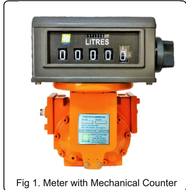
Fig 1. Meter with Mechanical Counter