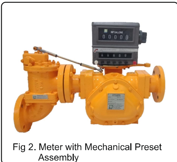
Fig 2. Meter with Mechanical Preset Assembly