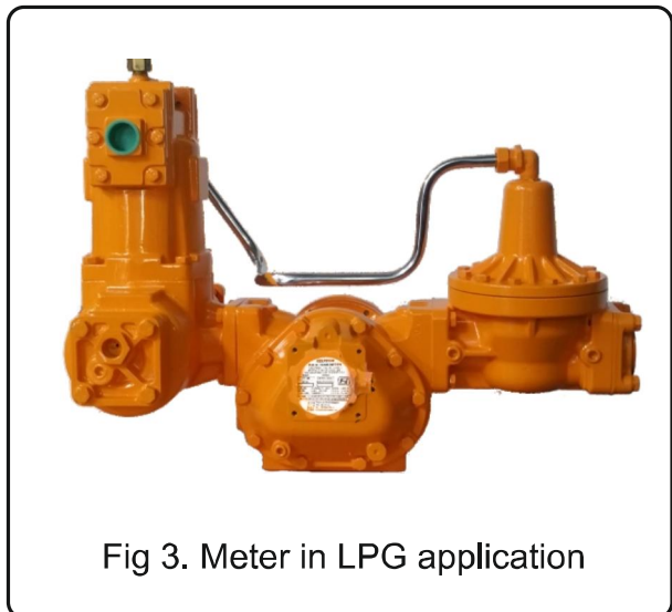
Fig 3. Meter in LPG application