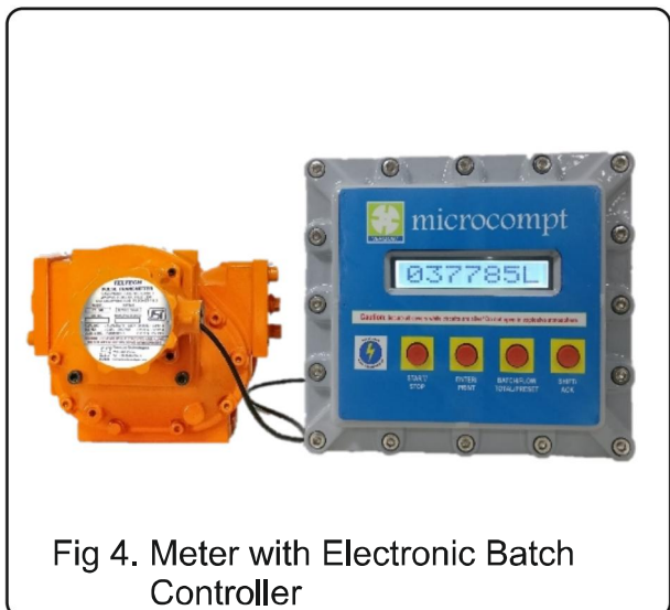
Fig 4. Meter with Electronic Batch Controller