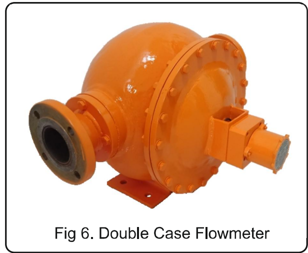
Fig 6. Double Case Flowmeter